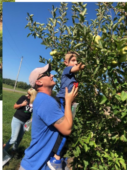
Happy Days Preschool visits Schwartz Apple Orchard in September.